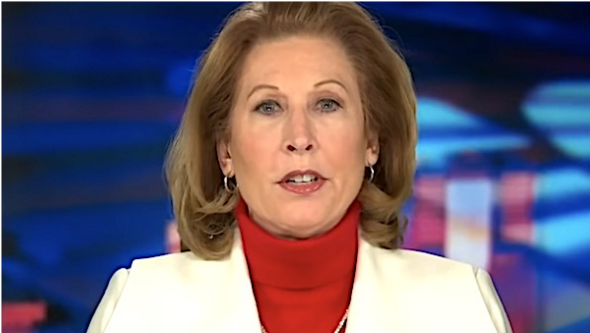
Sidney Powell (Video screenshot)

Is President Trump looking to appoint Sidney Powell as a special counsel to investigate voter fraud in the 2020 presidential election?