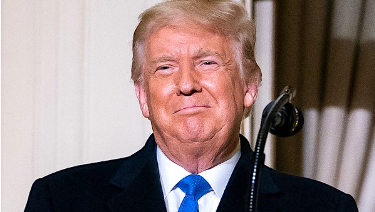
President Donald J. Trump participates in the pre-recorded National Christmas Tree Lighting Ceremony Monday, Nov. 30, 2020, on the Blue Room Balcony of the White House.