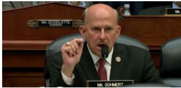
Rep. Louie Gohmert, R-Texas

Bannon, President Trump's former chief strategist, asked Gohmert if he has "the receipts to break the back of the Democrats" and "all the spin."