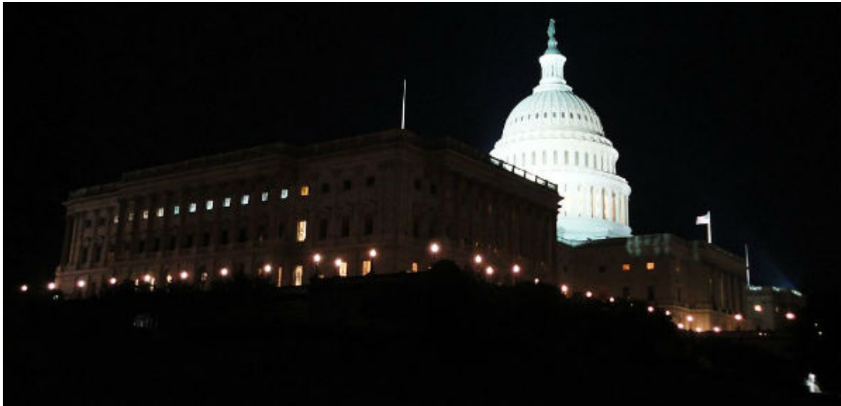
U.S. Capitol

On the eve of the joint session of Congress to certify the 2020 Electoral College vote, Texas Republican Rep. Louie Gohmert explained why he is one of at least 140 Congress members who will join at least 13 senators in objecting to slates of electors in battleground states.