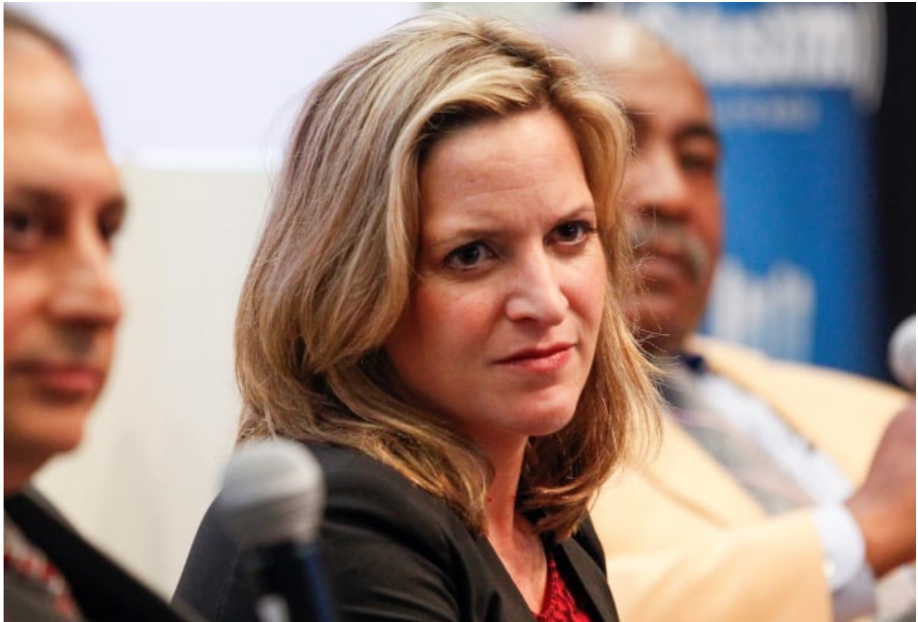
MI Democrat Secretary of State Jocelyn Benson

The fight in Michigan to expose what really happened in the November 2020 election is far from over.