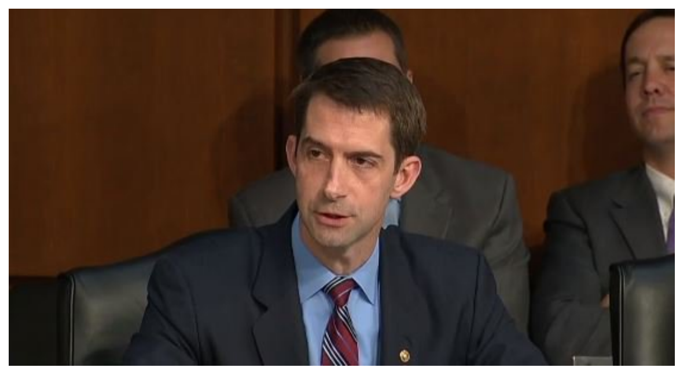
(File Photo: screenshot)

a 501(c)(3) nonprofit organization" citing recent news reports which have "confirmed the "long-established fact that the SPLC regularly engages in defamation of its political opponents."