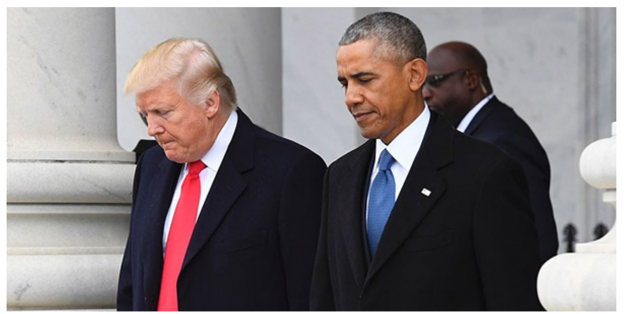
President Donald Trump with former President Barack Obama

It's abundantly clear now that the Obama administration tried to torpedo Donald Trump, first as a candidate and then as president-elect, using a Democratic Party-funded "dossier" of Russian propaganda to obtain warrants to spy on Trump's campaign.